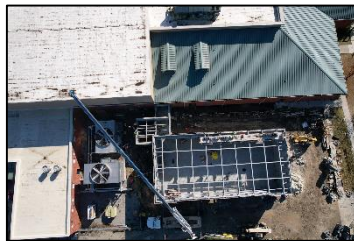
West Ashley HS Multipurpose Facility